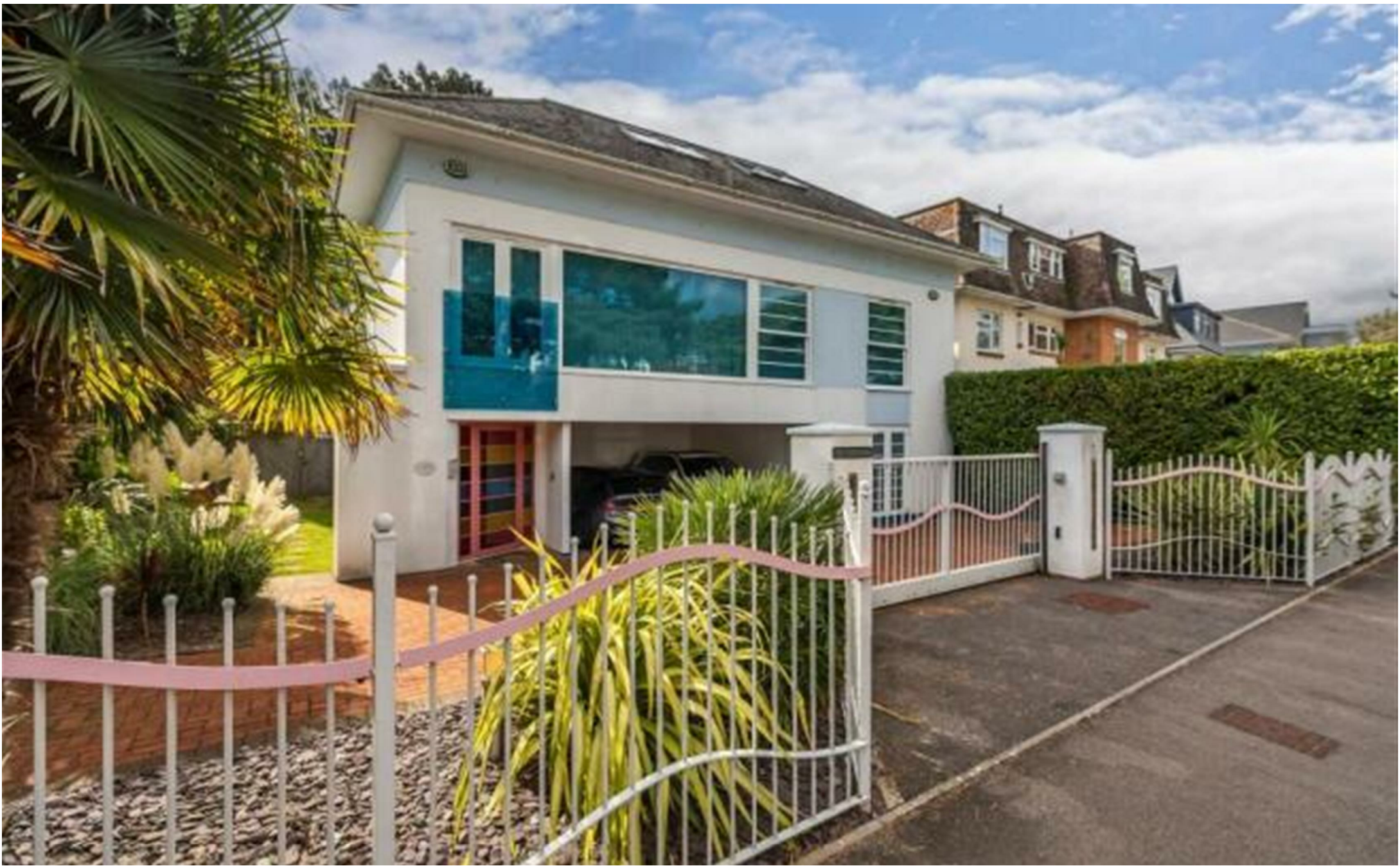
The Ferryman 1 Brownsea Road, Poole BH13 7QW £850,000 Share of Freehold